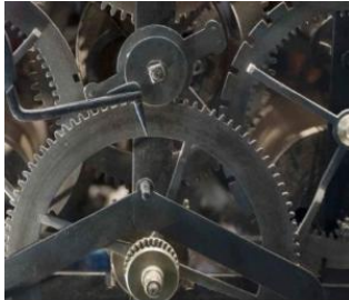
CUNNINGHAM COAL ENTRIES...